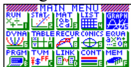
Icon # 5

Select one of the three icons shown GRAPH or TABLE mode from the main menu by using the arrow keys to highlight the icon required.