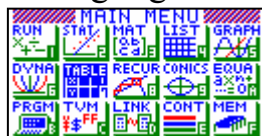
Icon # 7 for quick entry.

This worksheet is to help show the links between the three forms of mathematics.